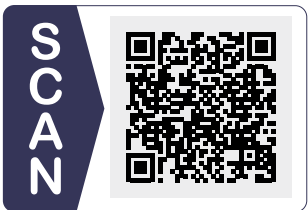
Scan for Corporate Registry

Note 1: If unsure of the business number, it can be obtained through a search on the PEI Business/Corporate Registry: