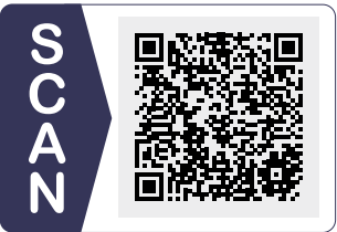
Scan for Payee Registration Form