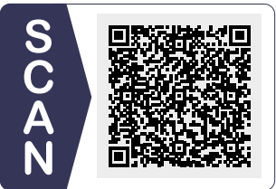
Transport Canada iZEV program information

For used vehicles: vehicles must have a sticker price of $70,000 or less and must not be older than seven years (i.e., 2023 purchase year: 2016 model or newer, 2024: 2017 model or newer, etc.)