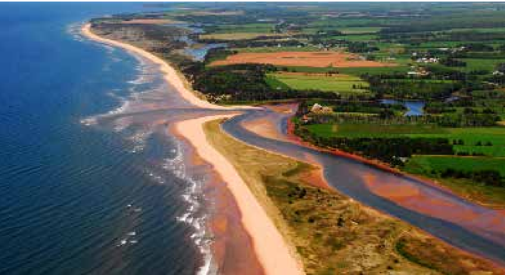
Basin Head, PEI

Travellers would clear customs at their first stop in Canada. PEI has no trans-border flights. Travellers would always clear at the connecting airport before coming to PEI.