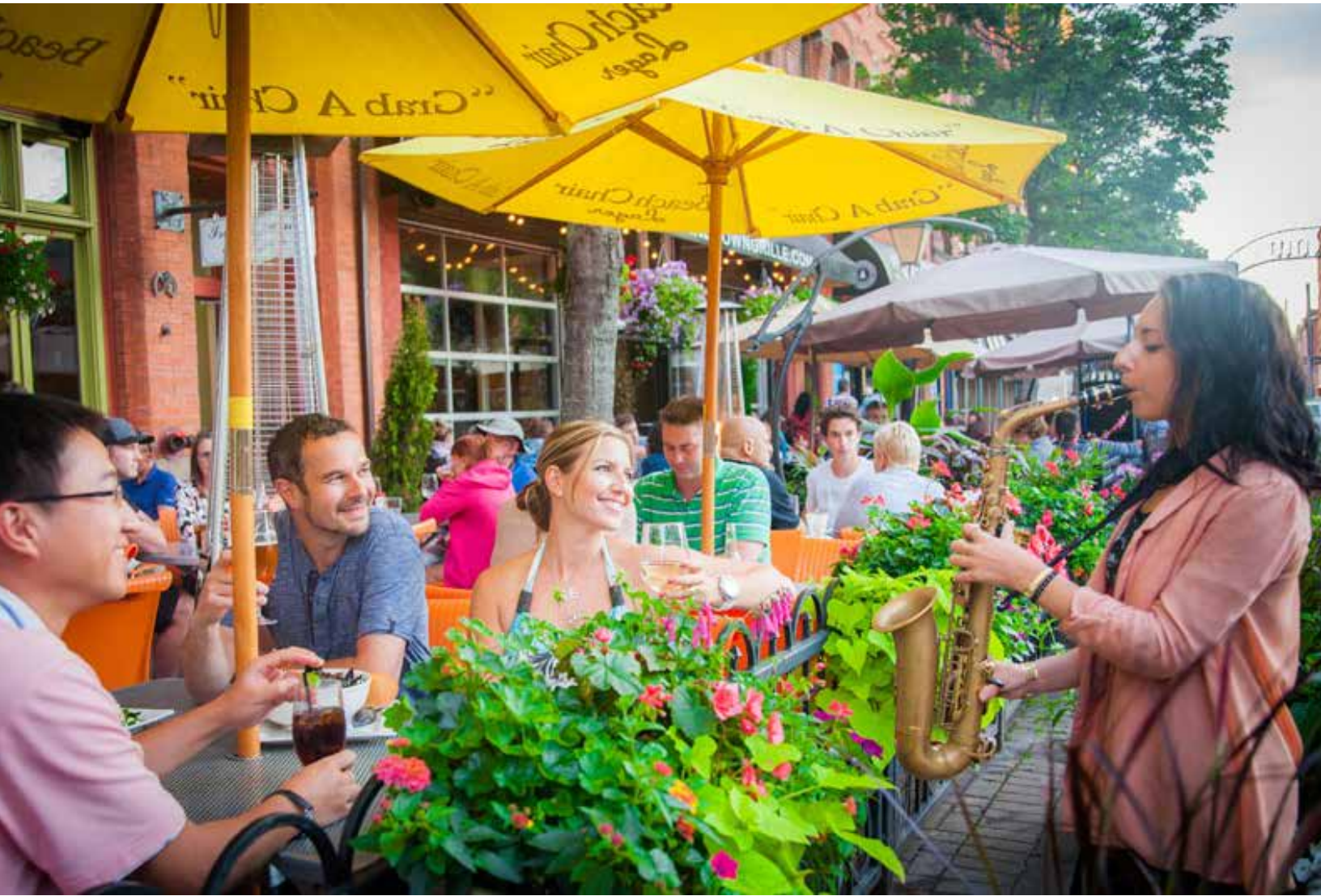
Victoria Row - Downtown Charlottetown