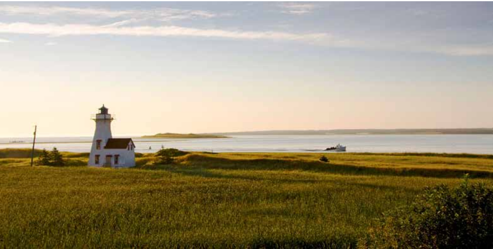
New London Lighthouse

The following websites provide information on the eligibility and application process to bring foreign workers into Canada for a specific film project. It is not all encompassing and the responsibility remains with the producer to ensure they are aware of all rules, regulations and requirements for foreign hires.