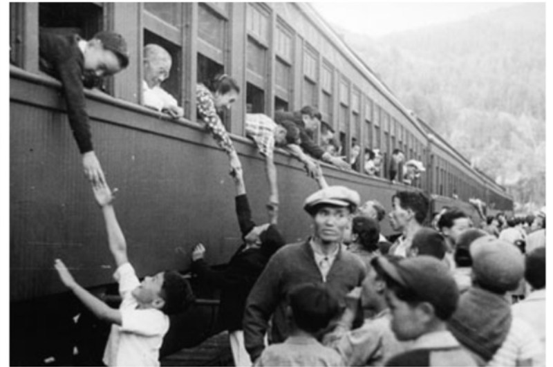
Japanese Canadians being relocated to internment camps during World War II. Today, we recognize that Canada's actions are not morally defensible, and the government has officially apologized and made reparations. Library and Archives Canada / C-057250

Are we condemned to repeat the past? Or could we learn something from X?