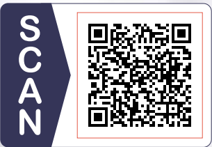
Net Zero Funding for You